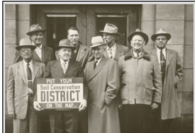
Conservation Districts were formed in response to the Dustbowl catastrophe of the 1920s and 1930s.

In addition, Soil and Water Conservation Districts (SWCD) in some states, such as Iowa, have regulations requiring farm operators to limit the soil loss to certain levels. 38 However, the mechanisms for enforcement as well as the will to enforce these rules is often limited. Again, while there are, perhaps, more effective means of protecting your land, such provisions do have a place in farm lease agreements. It may be beneficial to seek out your local SWCD commissioners, inquire about soil loss limits, and learn more about enforcing such limits on your property. In Iowa, complaints regarding soil loss limits can be brought by adversely affected neighbors or local officials. 39 Landowners are not included in the language of the statute.